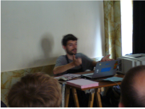
Canadian Printing Breakfast: travel report of a visit to the Libre Graphics Meeting in Montreal (Nepomuk, Brussels, 2007)

“A sane person”, says Zeno, “doesn't analyse himself, doesn't look in the mirror” 8 , just like software is paid attention to most of all when it doesn't work. When a hammer is broken, you realize how heavy and how big it actually is, how its weight is relative to your own strength and how its size relates to what you actually wanted to do with it. 9 Also proprietary programs have their bugs and glitches, but it is the automatic reflex of FLOSS developers not to avoid or hide them. On the contrary, it is important that imperfections remain visible so that users feel inspired to report them or do something about them.