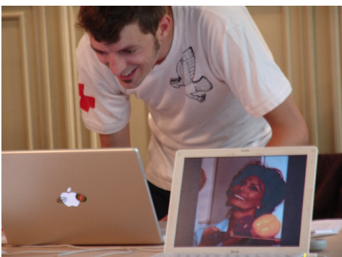
Print Party 2.0: Sophia Loren, "All you see I owe to spaghetti" (Quarantaine, Brussels, 2006)

Designer David Reinfurt observes, that the overdetermined functionality and staggering complexity of professional design software makes users restrict themselves to standard techniques and tools 3 . How could Free Software be more empowering? The fundamental difference it makes, is that it allows users to use, analyse, change and distribute source code and in a sense users literally get hold of their means of production. But while a computer programmer, by having the right to adjust software, can feel in control, every other 'power user' with the same rights, is practically blown away by the explosion of procedures, formats and processes she is confronted with. Let alone the fact that the 'means of production' for designers include more than their software 4 , our experience of designing with Free Software has shown us over and over again that 'owning' our tools is not the same as 'mastering' them.