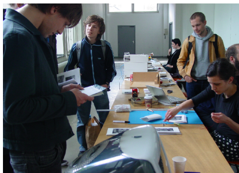
Print Party avant la lettre : production line for an 'exquisite corpse' publication as part of The Tomorrow Book Project (Jan van Eyck Academie, Maastricht, 2006)

Open Source Publishing (OSP) is a Brussels based design team that uses Free Libre and Open Source Software (FLOSS), open fonts and copyleft licences for its productions. We aim to make our designs available as source material whenever possible and try to convince our clients to do the same.