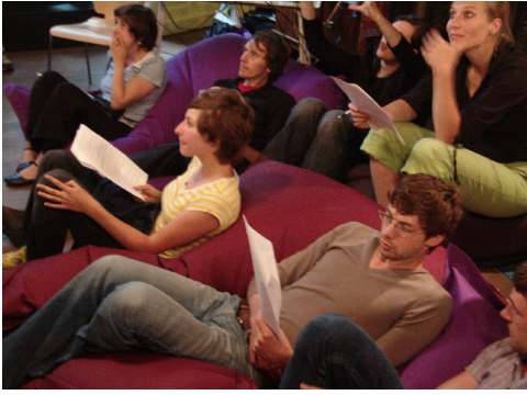
Print Party 2.0: Each of the 19 steps is carefully followed from the paper recipe (Quarantaine, Brussels, 2006)

This could also be a side effect of the Linux/Unix philosophy itself, where the emphasis is on small specific tools that are good at executing relatively simple and well-defined tasks with the intention of giving users as much freedom as possible in order to let them compose their own more complex configurations later. The software remains tangible, because the same recognizable elements can be connected to each other again and again in many different ways. With this modular structure of clearly defined 'clutches' in the form of pipes and standard streams (stdin and stdout), the shift from one action to another is easy to experience. And once you get to know this versatile set of tools a little better, you will detect their traces everywhere, even in more complex graphic applications.