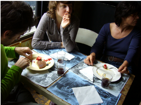
Canadian Printing Breakfast: Pancakes with maple syrup (Nepomuk, Brussels, 2007)

“A sane person”, says Zeno, “doesn't analyse himself, doesn't look in the mirror” 8 , just like software is paid attention to most of all when it doesn't work. When a hammer is broken, you realize how heavy and how big it actually is, how its weight is relative to your own strength and how its size relates to what you actually wanted to do with it. 9 Also proprietary programs have their bugs and glitches, but it is the automatic reflex of FLOSS developers not to avoid or hide them. On the contrary, it is important that imperfections remain visible so that users feel inspired to report them or do something about them.