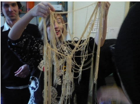
Free Operations: design students produce, cook and eat pasta while we talk to them about Free, Libre and Open Source Software (Werkplaats Typografie, Arnhem, 2007)

The Print parties that we organize now and then in a vacant café, a bookstore or a classroom are irregular public appearances whenever we feel the need to report on what we discovered and where we've been; as anti-heroes of our own adventures we keep contact with our fellow designers who are interested in our journey into the exotic territory of BoF, Version Control and GPL3 10 . We make a point of presenting each time a new experiment, of producing something printed and also something edible on site; it is the tension between parallel processes that defines those infectious events.