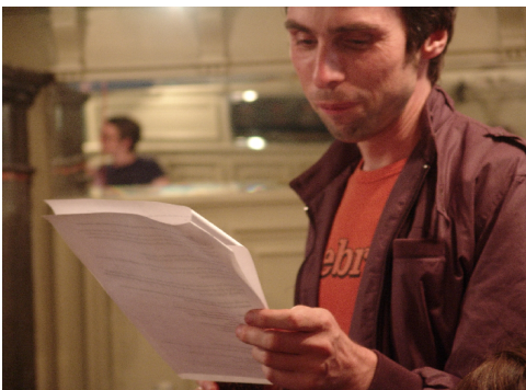
Print Party 2.0 (Quarantaine, Brussels, 2006)

In The Confessions of Zeno 6 , Italo Svevo describes how one evening Zeno strikes up a conversation with a doctor who explains to him at length how 54 muscles come in motion when you walk rapidly. Zeno becomes fascinated by this extraordinary account of the monstrous machinery of his own body, but his curiosity proves to be fatal: "Of course I could not distinguish all its fifty-four parts, but I discovered something terrifically complicated which seemed to get out of order directly I began thinking about it. I limped, leaving that café; and I went on limping for several days." From that moment on he is unable to think about this memorable evening, the doctor or even about his own legs without starting to stagger.