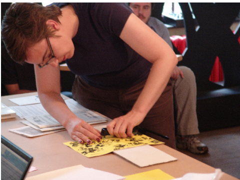
Print Party 2.0: The 19 commands that we typed one by one into the terminal caused a funny yet fascinating spectacle that ended only when 16 pages were correctly printed, folded and stapled together. (Quarantaine, Brussels, 2006)

This could also be a side effect of the Linux/Unix philosophy itself, where the emphasis is on small specific tools that are good at executing relatively simple and well-defined tasks with the intention of giving users as much freedom as possible in order to let them compose their own more complex configurations later. The software remains tangible, because the same recognizable elements can be connected to each other again and again in many different ways. With this modular structure of clearly defined 'clutches' in the form of pipes and standard streams (stdin and stdout), the shift from one action to another is easy to experience. And once you get to know this versatile set of tools a little better, you will detect their traces everywhere, even in more complex graphic applications.